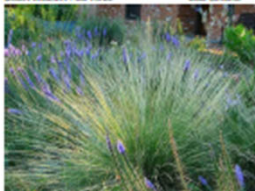
Muhlenbergia dubia Blue Muffin