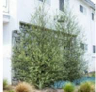
Photinia leucosticta Silver Sheen Silver Sheen Koushi