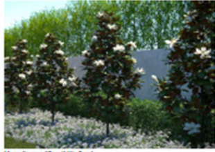
Magnolia grandiflora Little Gem Little Gem Magnolia