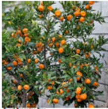
Dwarf Tangerine Tree