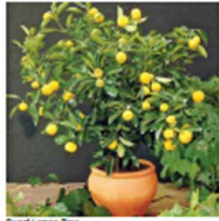
Dwarf Lemon Tree