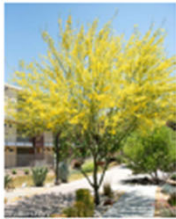
Pachira aquatica Desert Museum Desert Museum Palo Verde