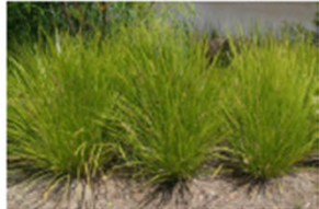
Limonium hybridum Lime Tuff Lime Tuff Mat Rush