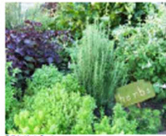
Edible Herb Garden