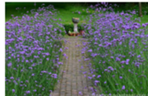
Verbena bonariensis Purple Top