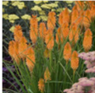
Knapweed Orange Red Hot Flower