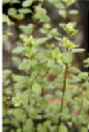
Leaf Detail Silver Sheen Koushi