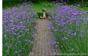
Verbena bonariensis Purple Top